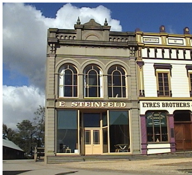
Steinfeld's Furniture Factory at Sovereign Hill

http://adbonline.anu.edu.au/biogs/A060200b.htm?hilit=E%3BSteinfeld